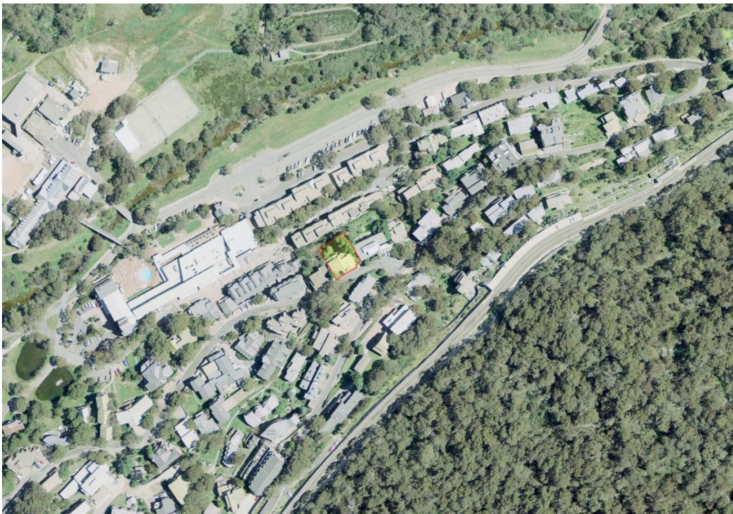
Figure 1: The site outlined in red

The site is identified in Figure 1 of this SEE.